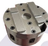
CNC heads: 50/100 vintage and new styles (dovetail & extended) available + CNC head rebuilds