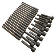
Ejector Rods & Heads: All standard machine sizes + custom rods/heads